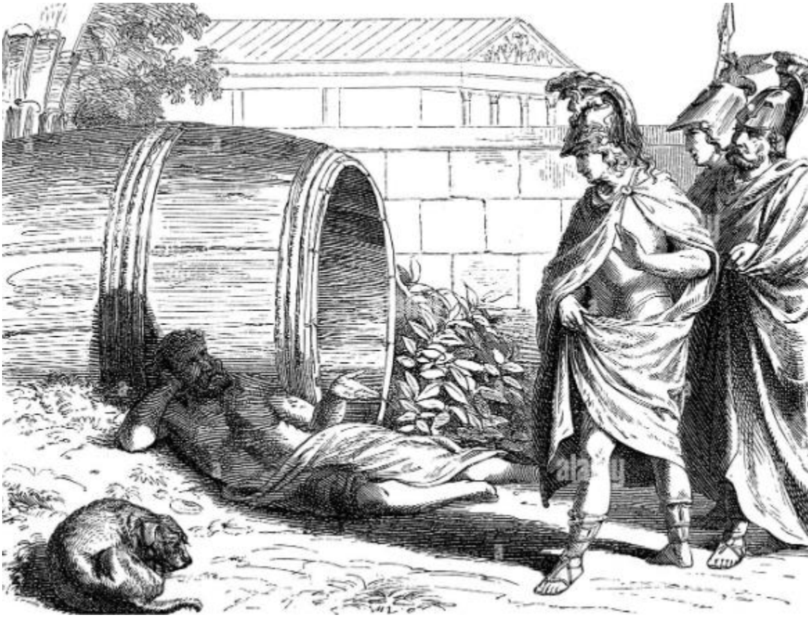
Table 4. Diogenes and Alexander the Great 1

Stoics agreed on the virtuous character of Socrates, and they agreed that one should live a rationally-guided life not explicitly in pursuit of pleasure. However, Stoics did not agree with the Cynics' full rejection of society.